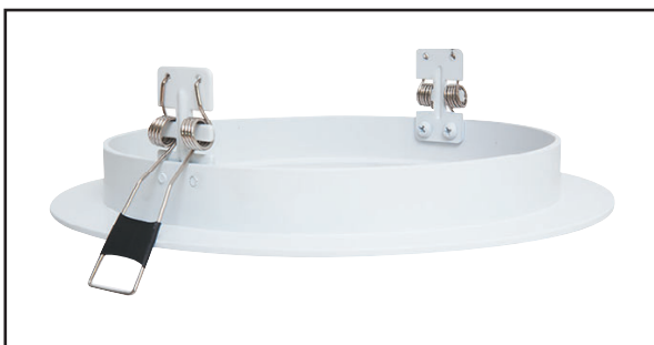
OPTIONAL 320mm ADAPTOR PLATE